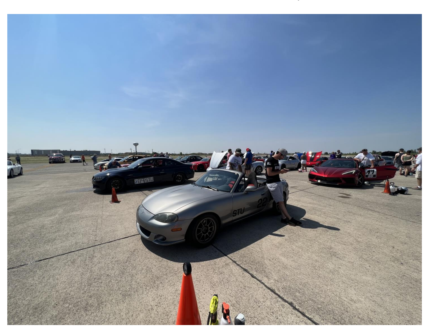
Solo Grid before the action starts at an Indy Solo at Grissom.