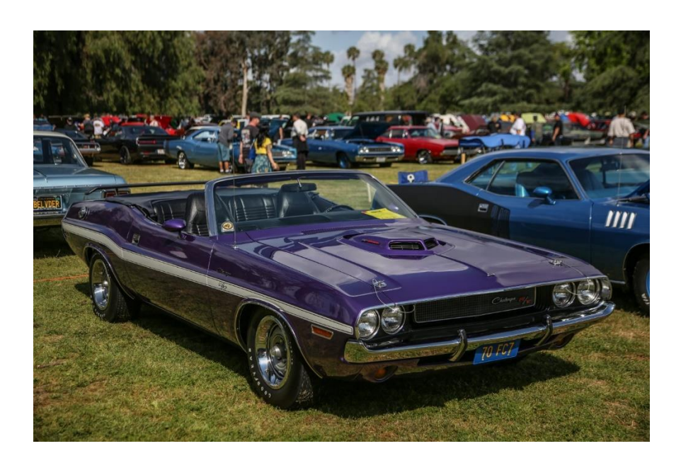
Summer car shows are always fun