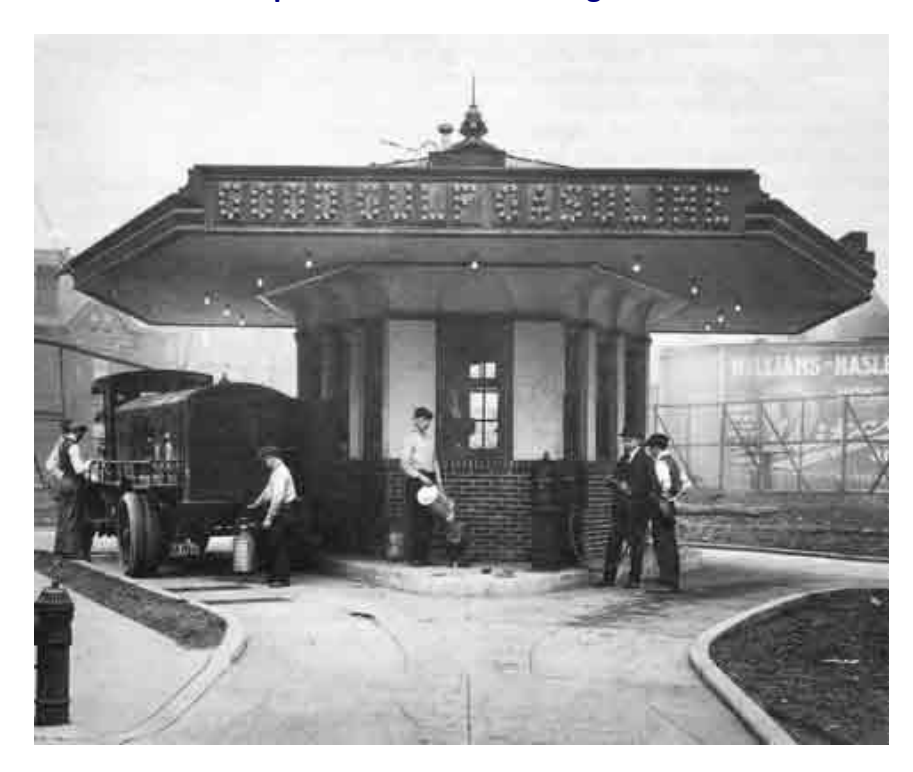
See the back page for the answer