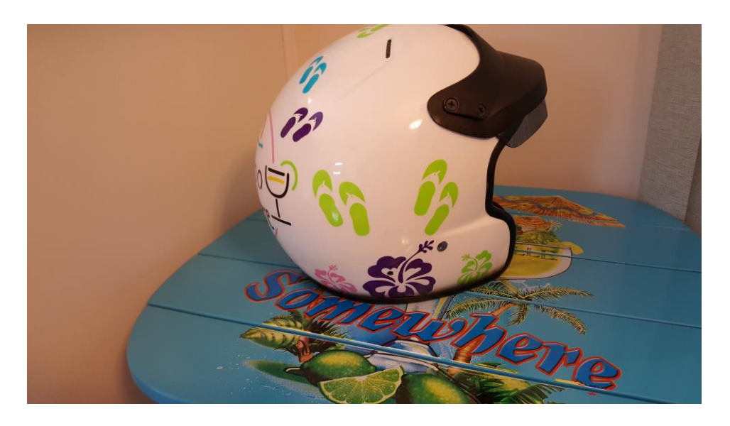
Velma's helmet ready to go to Solo Nats in Lincoln